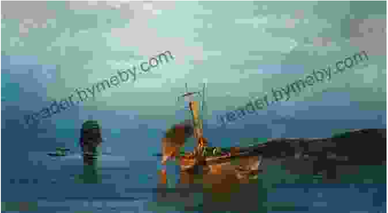
Konstantinos Volanakis, "Waves Crashing on the Shore," c. 1920