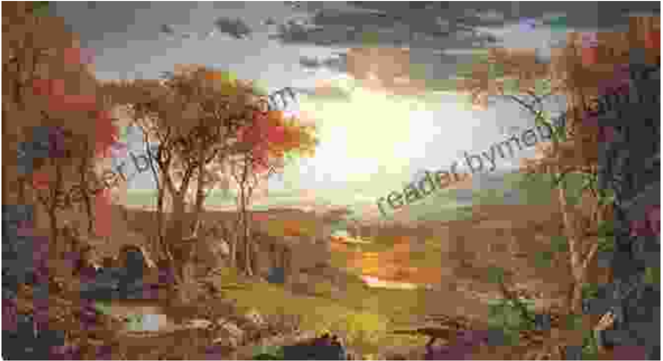
Jasper F. Cropsey, "Autumn on the Hudson River," 1860