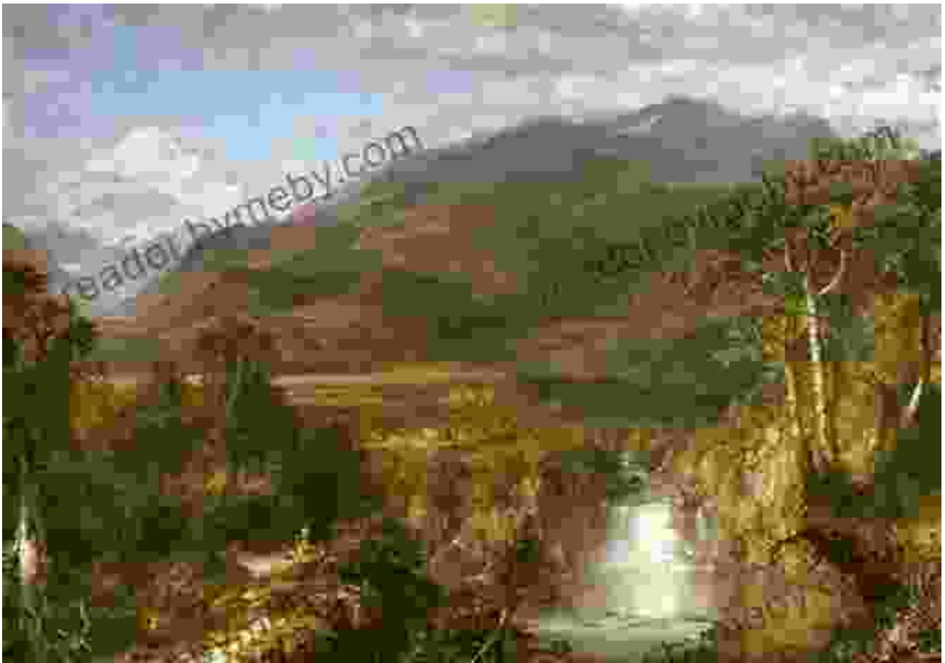
Frederic Church, "The Heart of the Andes," 1859