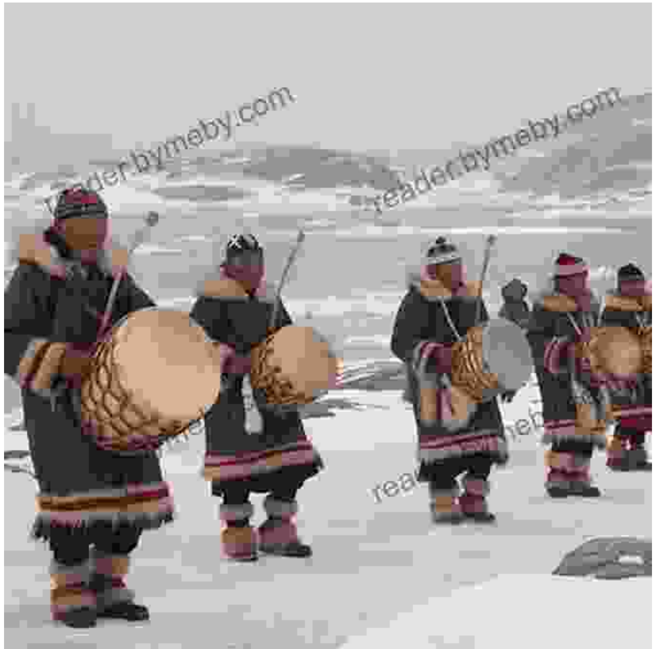
Celebrating cultural heritage