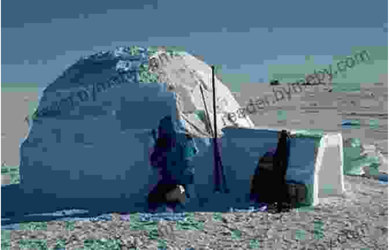
Building a shelter from ice