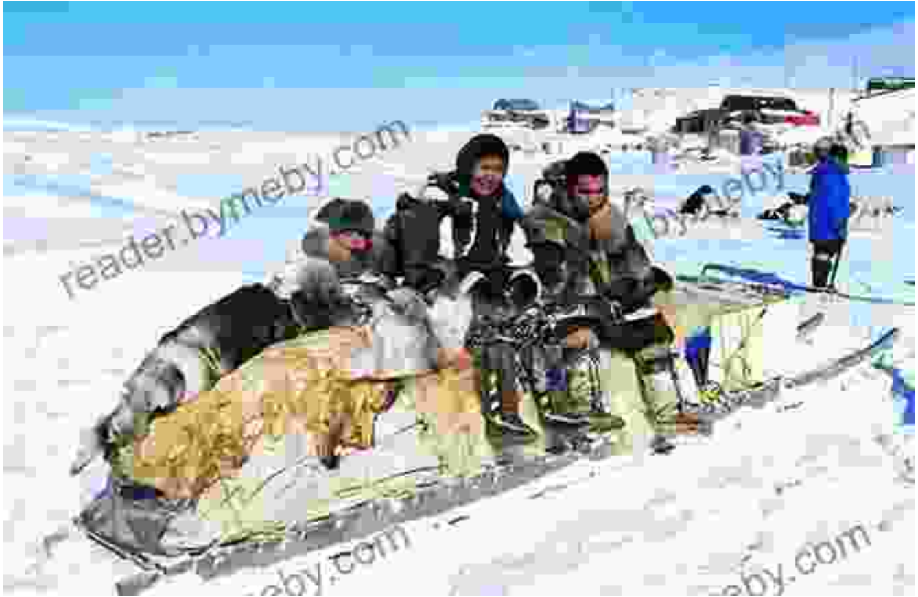
Preparing for the hunt