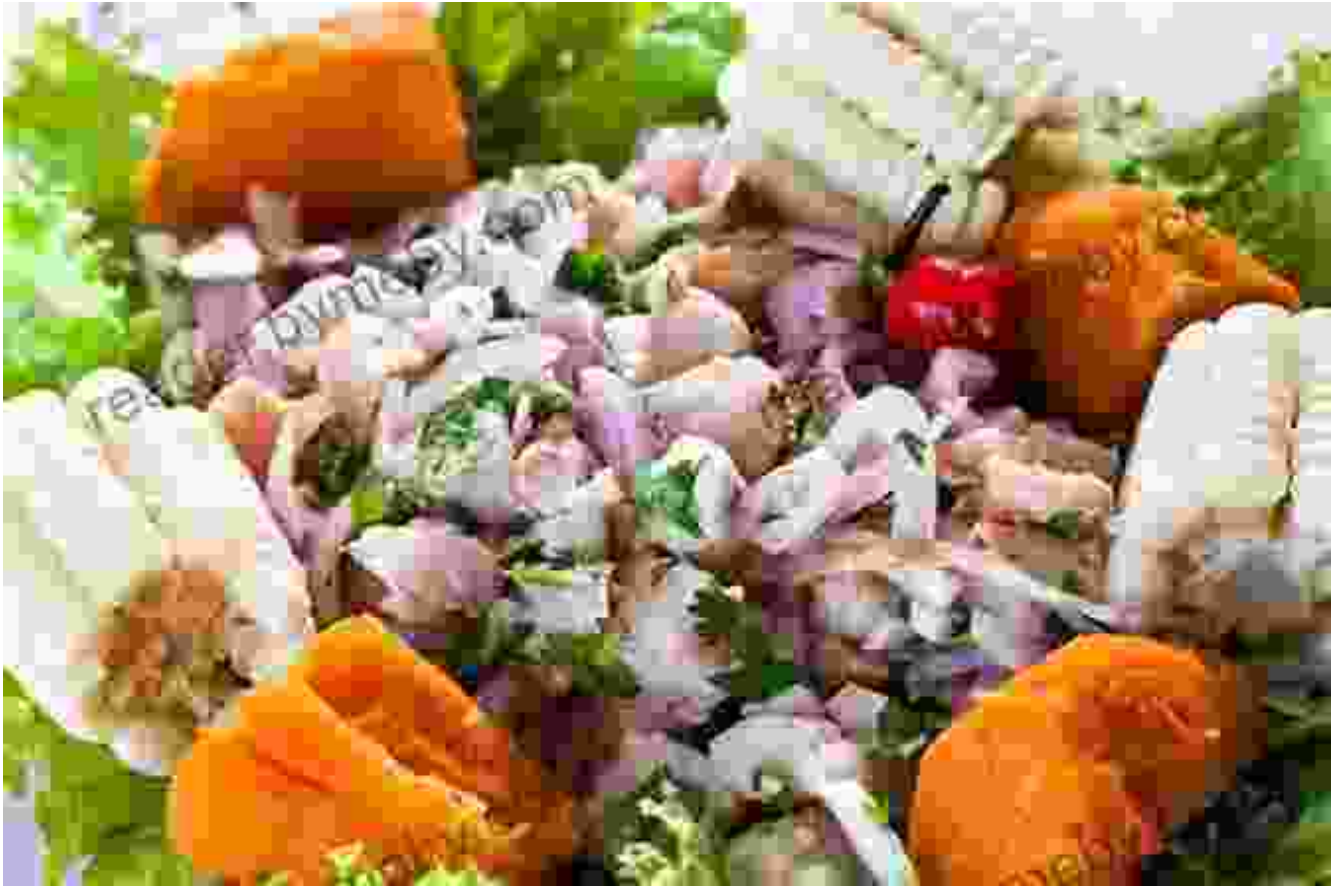
Ceviche, a traditional Chilean seafood dish