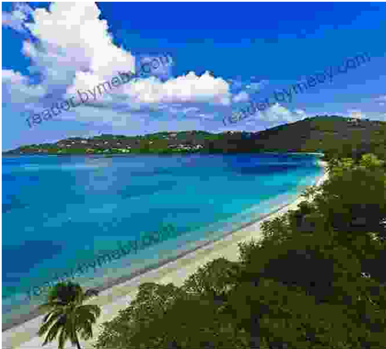
St. John: A Natural Paradise

St. Thomas welcomes you with its vibrant capital city, Charlotte Amalie. Stroll through its charming streets lined with colorful buildings, duty-free shops, and delectable restaurants. Ascend to Paradise Point for panoramic views of the island's picturesque coastline. At Magens Bay, immerse yourself in the pristine waters and soft sands, ranked among the world's most beautiful beaches.